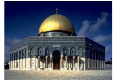
The Dome of the Rock, located on the Site of the First and Second Temple

Daniel lived 600 years before the birth of Jesus, yet Daniel foretold one of the most profound prophecies about Jesus and the end of the age. Daniel in the 9 th chapter of his book gave us to the day the time Jesus would be “cut off” by Jewish leaders. Daniel then proclaimed the destruction of Jerusalem and the Temple would follow. He then gives us details of the final period of this age, the tribulation, when the Jews would build a third Temple in Jerusalem.