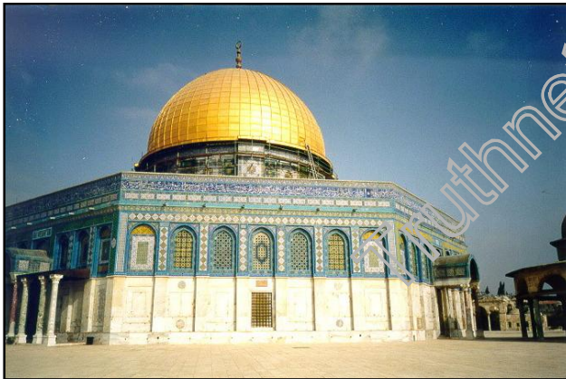
The Dome of the Rock, Location of the Jewish Temple

Allah hath purchased of the Believers their persons and their goods; for their (in return) is the Garden (of Paradise): they fight in His Cause, and slay and are slain: a promise binding on Him in Truth, through the Law, the Gospel, and the quran Qur'ān: and who is more faithful to his Covenant than Allah? Then rejoice in the bargain which ye have concluded: that is the achievement supreme.